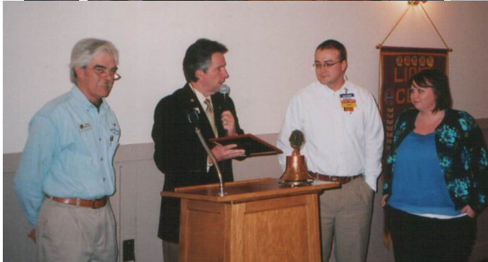
⇒ Certificate of Appreciation presented to WalMart Corp representatives at Feb 16